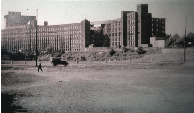
Cleveland Worsted Mills, Ackley Road

Cleveland once ranked as one of the nation's leaders in garment manufacturing, thanks in large part to the Cleveland Worsted Mills. An immense sight in its heyday, the plant suffered years of neglect and decline after its