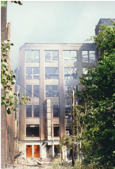
fire of July 4, 1993

Textile Workers Organization. Rather than continue talks, Cleveland Worsted Mills chose to liquidate its assets in January of 1956.