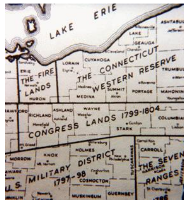
The "Western Reserve"

The Revolutionary War temporarily halted the boundary disputes. Following the war, states holding western claims surrendered them to Congress to form the public domain. In 1786 Congress accepted Connecticut's claim and the state was allowed to reserve about 3 million acres for its future needs. Connecticut reserved the westernmost one million acres, known as the "Firelands," as reparation for its citizens whose property was destroyed by the British in the Revolutionary War. The rest was to be sold for not less than $1 million to the Connecticut Land