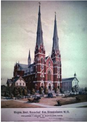
St. Stanislaus, 1891

pastor of St. Stanislaus, where he immediately set about making improvements. A rectory was built in the fall and the frame church was enlarged in early 1884.