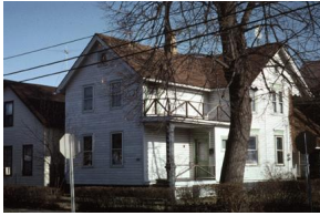
Poland Street house

100 unemployed workers began preparing the land for a frame church that, according to the contractor, would be completed by August.