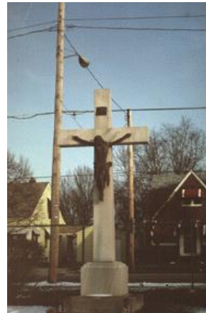
St. Mary Cemetery