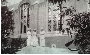
a new church

By 1914 work had progressed to the point that The Munich Studio of Chicago could install the first two stained glass windows. Possibly due to disruption of normal commercial activity during World War I, this project was not completed until 1918.