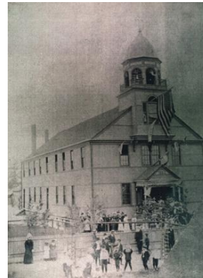
original IHM, 1894